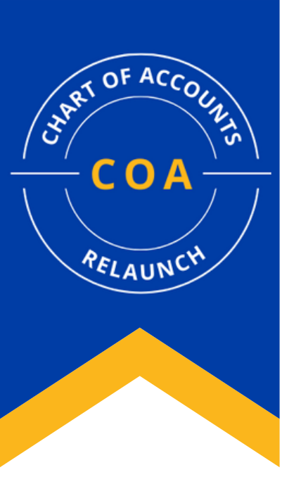
Chart of Accounts Update

UC Riverside will implement a revised Chart of Accounts when we launch the Oracle financial system in July 2023. UCR's new Chart of Accounts (COA) was designed based on a common chart of accounts across the UC system and to meet UC reporting requirements. The workgroup attempted to retain UCRFS values and/or existing FAU structures where feasible.